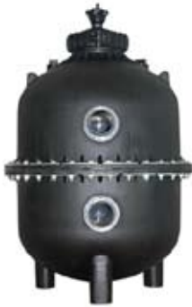
Plastic Sand Media Filter Series AFPSV2030

A newly developed product range of plastic sand media filters made out of Polyamide raw material which comes in three outlet sizes of 2", 2 1/2" and 3". This product has many advantages over the standard metallic sand media filters particularly its long service life due to high resistance to rust, operational wear and tear caused by the highly pressurized water which can be abrasive to the inner walls of any filter. It does not require re-painting season after season. The maximum working pressure is 6 bar.